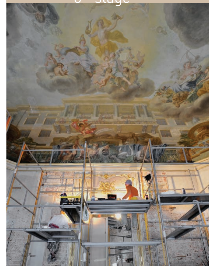
Muzeum Pałac w Wilanowie

→ Revitalization and digitalization of the 17 th century palace and garden complex in Wilanów – 3 rd stage