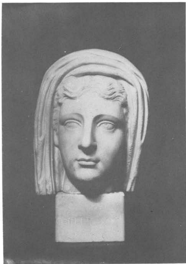
45. Head of a veiled woman