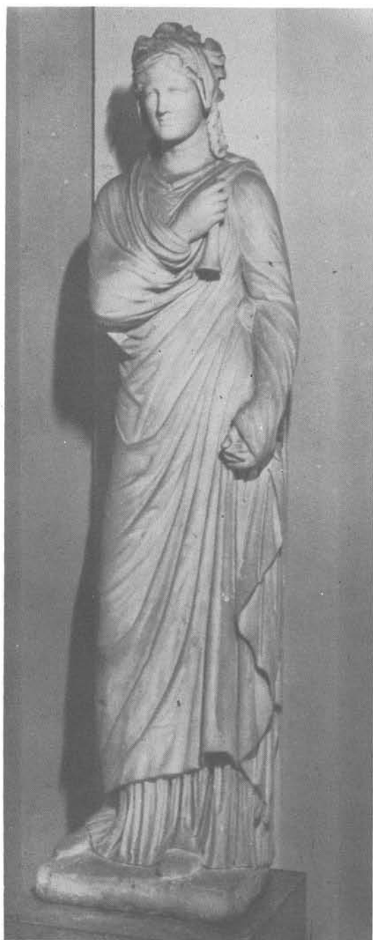
43. Statue of a woman with trumpet