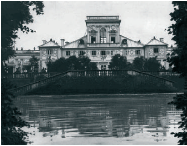
Wilanów flooded – water standing on the lower terrace of the baroque gardens, July 1934