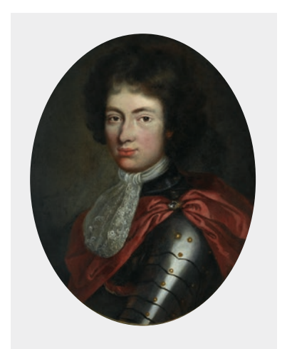
Jakub Ludwik Sobieski, French painter. Museum of King Jan III's Palace at Wilanów

The Museum of King Jan's Palace at Wilanów has for many years been conducting scholarly research and undertaking popular-science activities focused on the Sobieski family. In the framework of the research co-operation agreement with the National Historical Archives of Belarus in Minsk (NGAB) and with the aid of funding obtained from the Ministry of Culture and National Heritage, the Museum of King Jan's Palace at Wilanów has now undertaken to conduct a systematic research of the contents of the Radziwiłł Archive in Minsk with the aim to find the sobiesciana which it may contain.