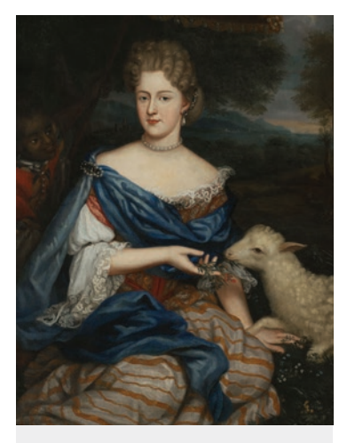
Karolina Sobieska Duchess of Bouillon, unknown painter. Museum of King Jan III's Palace at Wilanów

Owing to the financing obtained from the Ministry of Culture and National Heritage, Polish